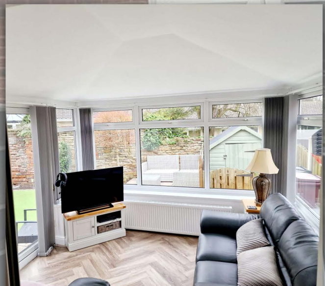
Internal Plasterboard Finish

This internal insulation solution is a short to medium-term option that provides immediate benefits in terms of temperature control and energy efficiency. It is a cost-effective alternative to more extensive roofing or solid roof replacements.