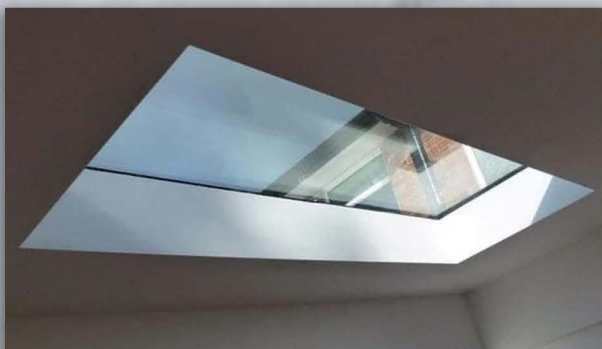
EPDM Rubber Roof with Skylight

After the roofing installation, we offer two options for the internal finish. You can choose between a plasterboard finish and skim or an UPVC finish. Both options provide a clean and polished look to your conservatory's interior.