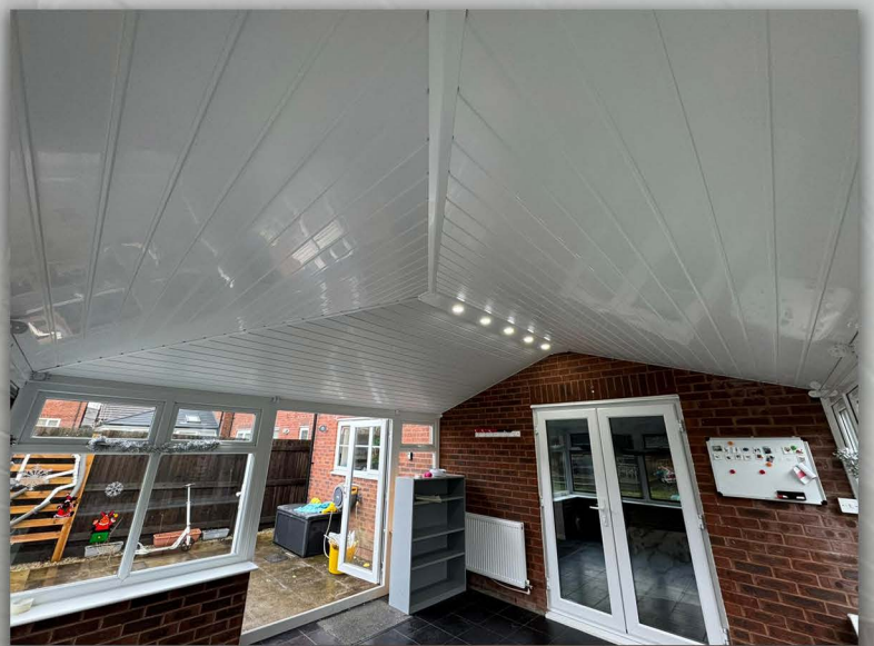
Internal PVC Finish

For the internal finish, you can choose between a UPVC finish or a plasterboard finish. Both options provide a clean and polished look to your conservatory's interior. Additionally, you can opt to have spotlights installed to enhance the lighting in your conservatory.