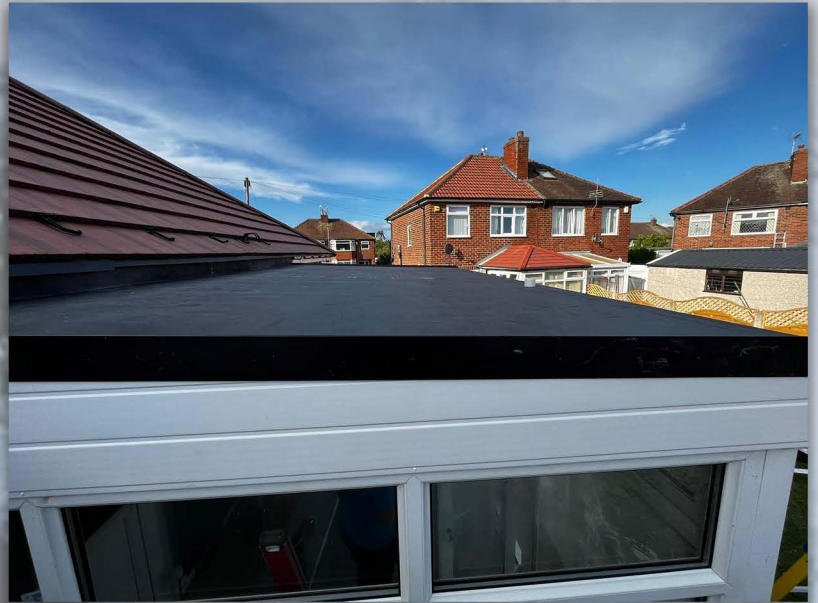
EPDM Rubber Roof without Skylight

To ensure compliance with building regulations, we also provide insulation services for your roof. This will help maintain a comfortable temperature inside your conservatory and reduce energy consumption.